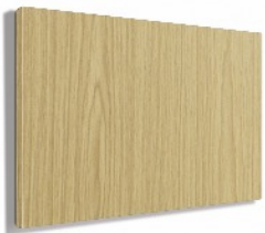
Oak Top Finish